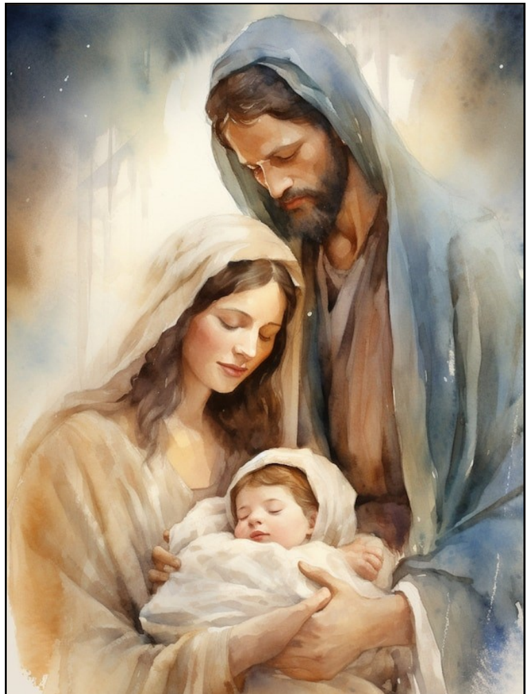
The Holy Family