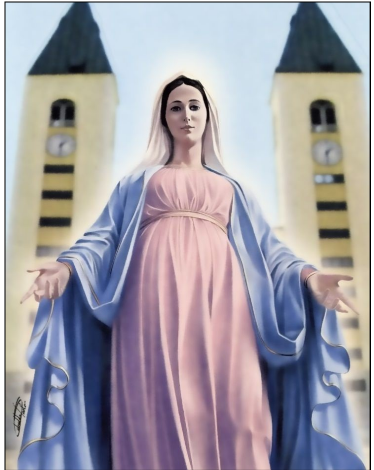
Queen of Peace