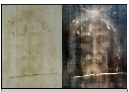
The face of a crucified man on the shroud