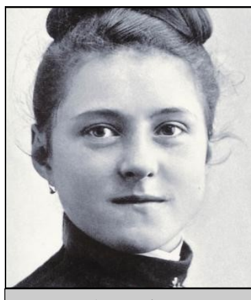
St. Therese of Lisieux

In her book, The Story of a Soul , Little Thérèse of Lisieux shares some wonderful messages about her love for Jesus and her way of pleasing Him. One of her discoveries, although very original, can be imitated by anyone, and can open up new perspectives in the way we receive Jesus during Mass.