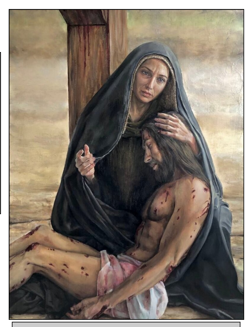
Woman, Behold Your Son